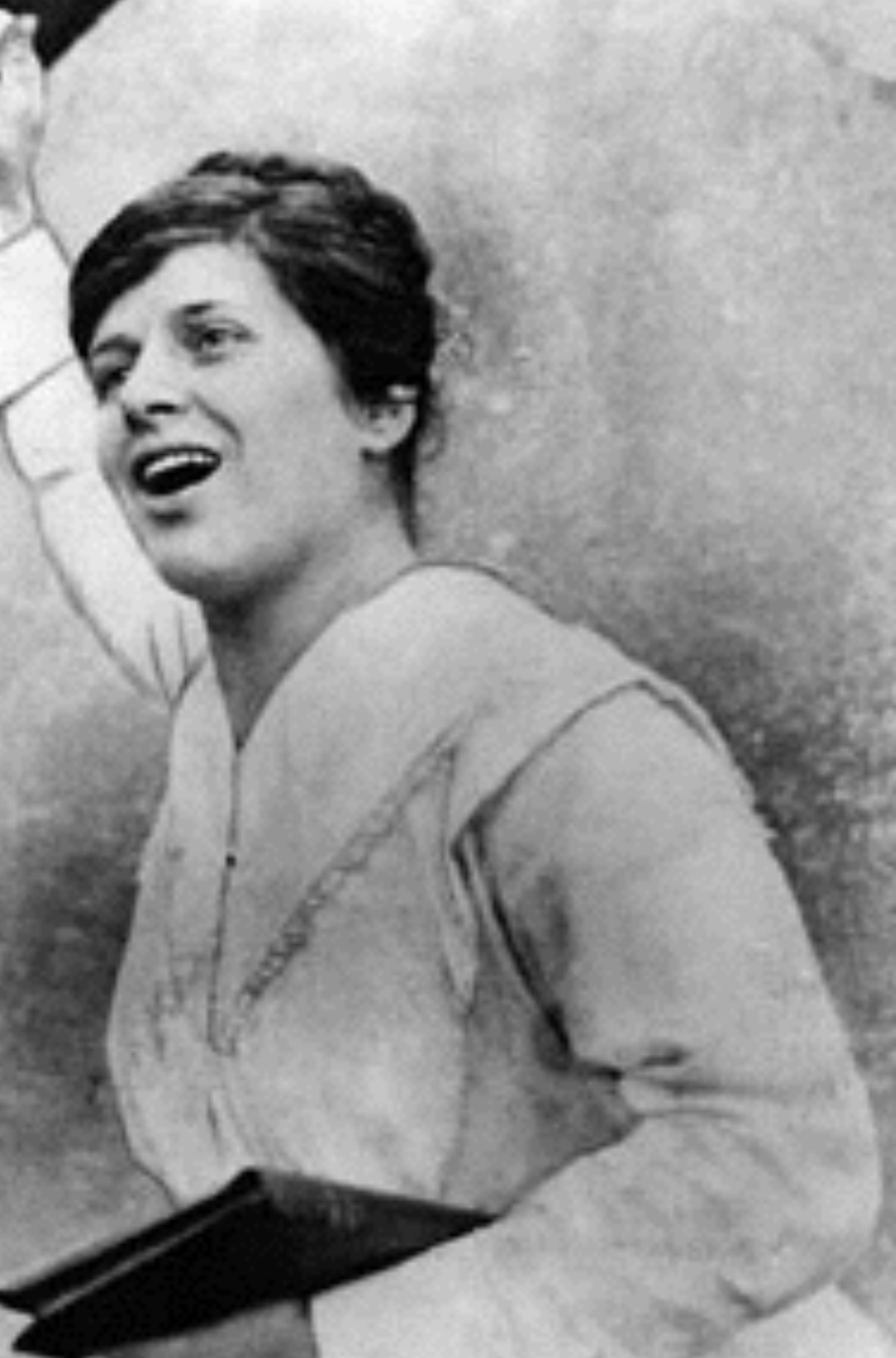
Aimee Semple McPherson